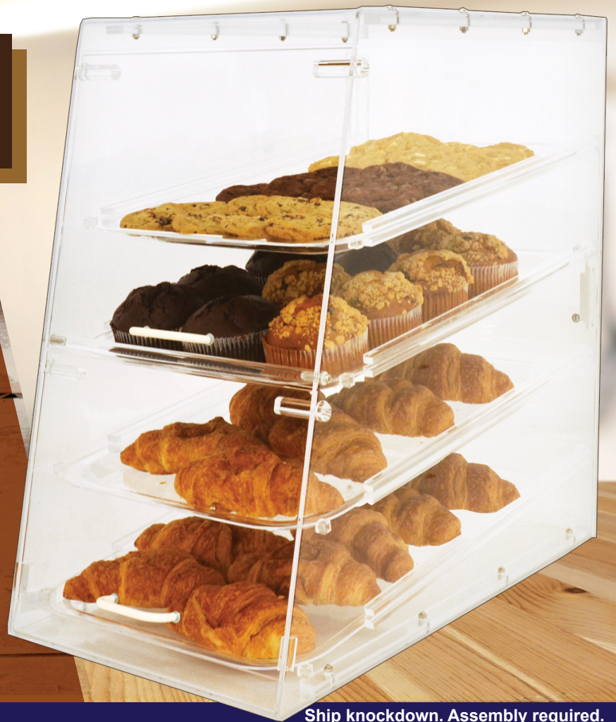
Ship knockdown. Assembly required.

Our sturdy acrylic display case provides clear view of your freshly baked goods. Features magnetic-latching rear doors, removable trays and white handles. It is designed for easy restocking and cleaning. Comes with front doors to ensure that your customers have easy access to your delicious pastries anytime. Ideal for cafes, catering companies, concession stands, and more.